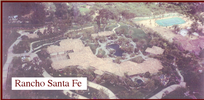
Rancho Santa Fe

The Rancho Santa Fe Development Company has been creating custom estate homes for 13 years.....Making your dream home a reality is our only business.